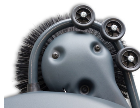
Castor wheels on the bumper