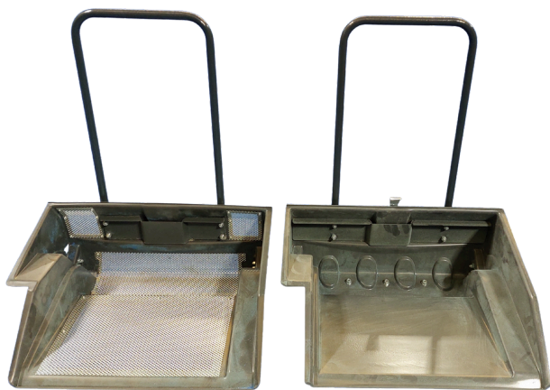
Dustbin with mesh for sand filtration